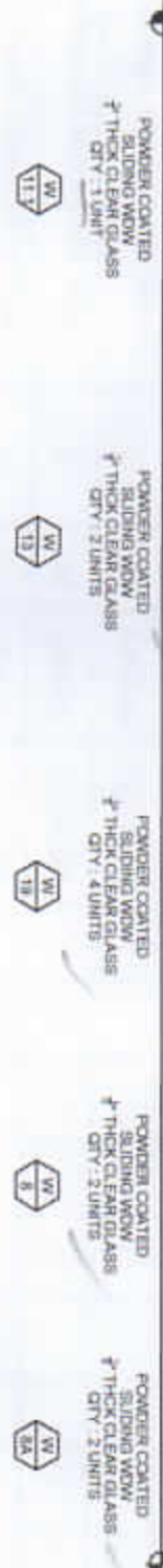
THE FINE LINE