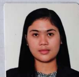
RER AUBRE B DALMACIO