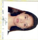
Picture and signature of subject

CIVIL SERVICE COMMISSION Republic of the Philippines