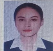
OSHC REU VIII Online BOSH 501 25-03-29