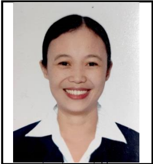
is not acceptable PHOTO