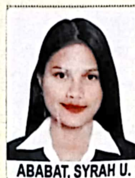
ABABAT, SYRAH U.