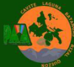
SIERRA MADRE CHAPTER