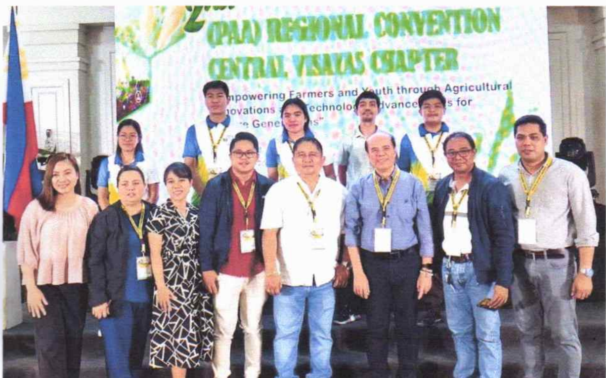
The photos above show the hardworking TWG team at the 2nd PAA Convention, ensuring its success.